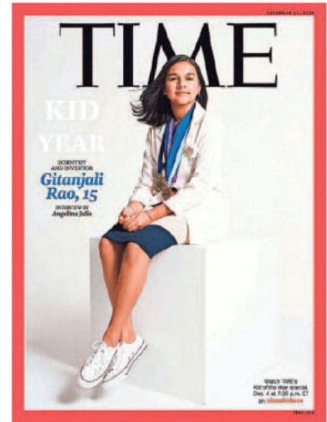
Gitanjali Rao, a 15-year-old Colorado high school student and scientist, has been named Time Magazine's first-ever "Kid of the Year."