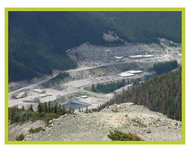
Henderson Mine from Stanley Mt. Google Earth photo courtesy of Craig Fagerness

Additional details regarding meeting locations, times, costs, and reservations, etc. will be published in upcoming newsletters.