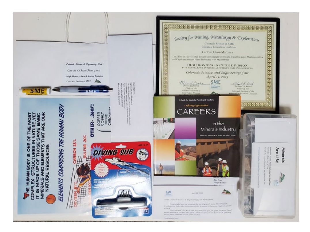
Students with winning projects received these gifts.