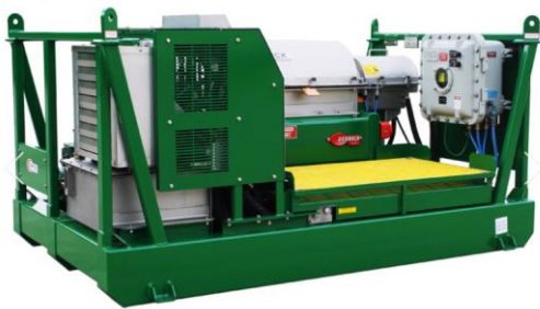
DE-1000 FHD (Full Hydraulic Drive)

Abstract: Over the last few decades, Derrick Corporation has provided many improved solutions to the status quo equipment utilized in the gold processing industry. These improvements have lead to savings in time, energy, recovery, and headaches when it comes to processing gold.