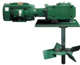
Mud Agitator (Horizontal)