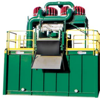
Fines Recovery System