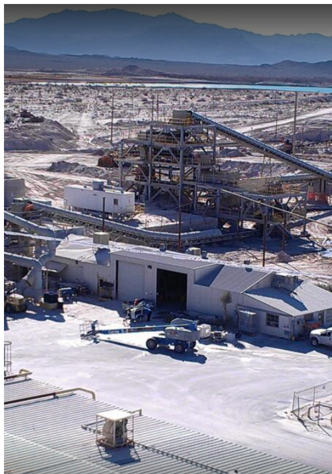
Las Vegas Operations