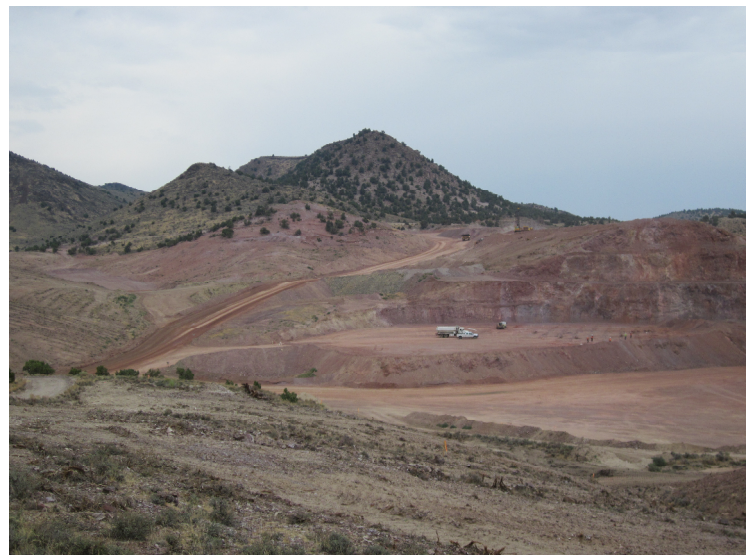
Part of the north pit at Pan Mine, facing north, showing about half of the pit and part of the cleared area that will be the waste dump